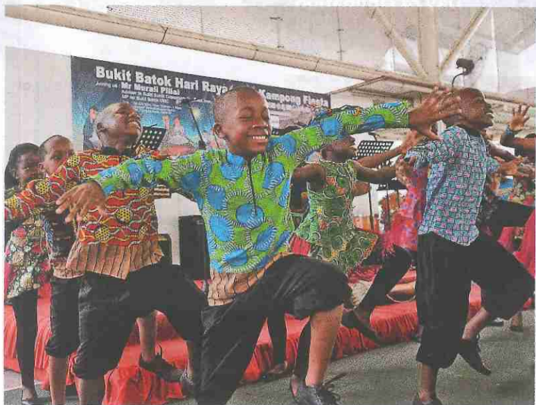
A musical treat from the Ugandan Mwangaza Children's Choir.