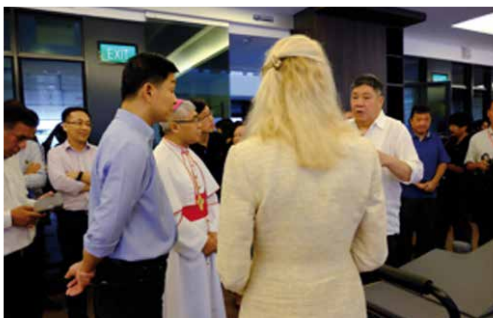
ABLE Rehabilitation Centre - Official Opening of Agape Village, 21 November 2015