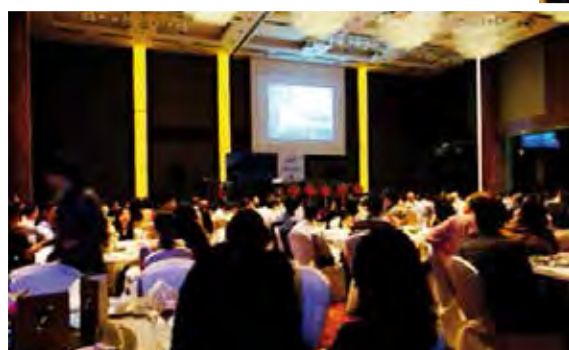
ABLE Charity Dinner 20 November 2015

Look out for more details of the next charity dinner in the second half of 2016 on ABLE's website.