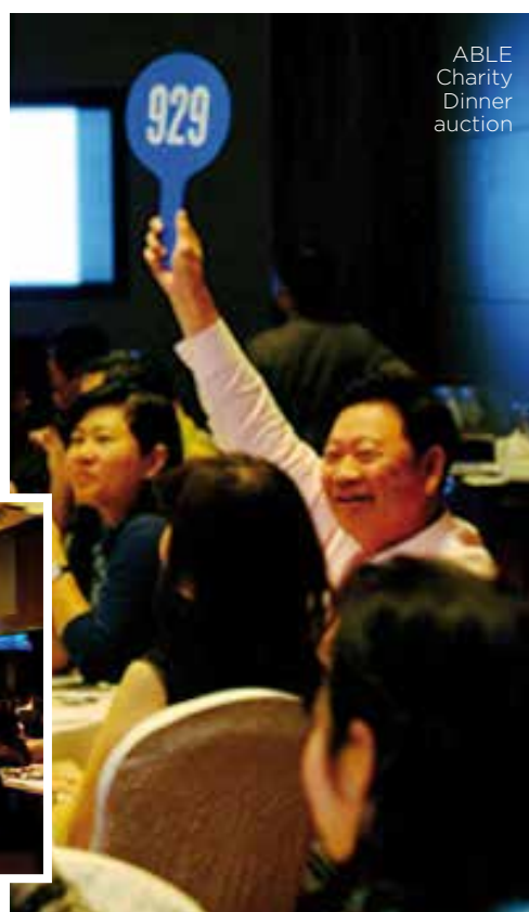
ABLE Charity Dinner auction